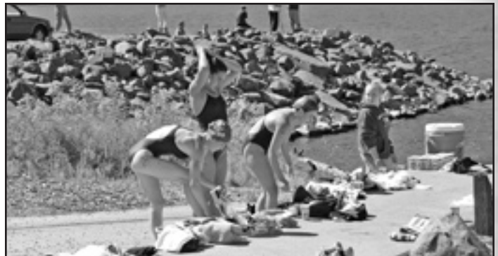
WSU swimmers in the transition area.