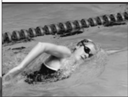
Sophomore • Freestyle, Backstroke Rutherglen, Australia • Rutherglen High School '02