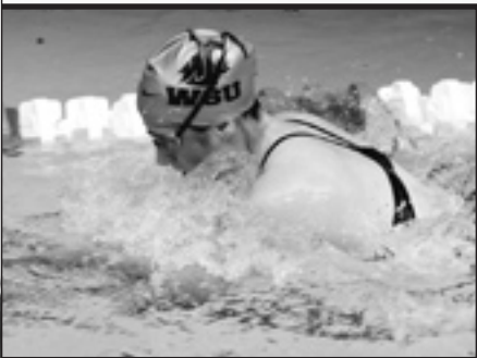
Sophomore • Sprints, Breaststroke Bainbridge, Wash. • Bainbridge High School '03