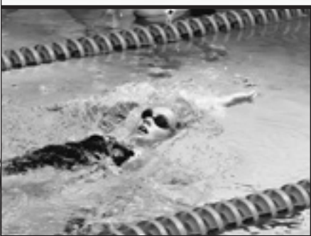
Sophomore • Backstroke, IM, Freestyle Los Altos, Calif. • Mountain View High School '03