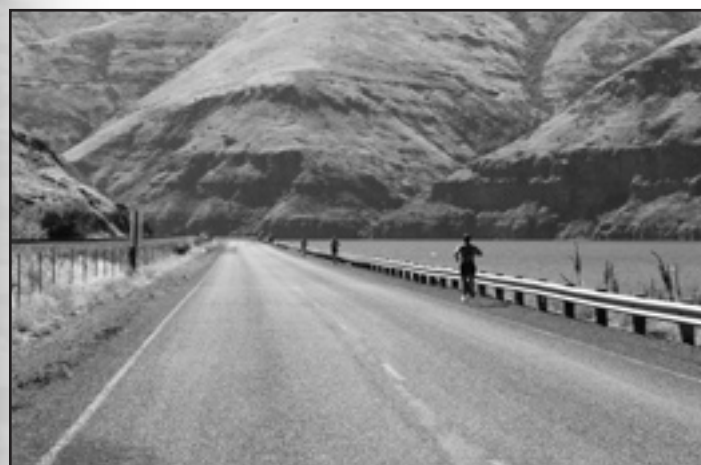
The 2.2 mile run to the finish line.