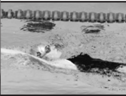
Sophomore • Freestyle, Backstroke Pendleton, Ore. • Pendleton High School '03