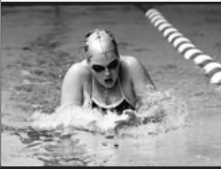
Junior • Breaststroke, IM, Freestyle Wellington, New Zealand • Hastings Girls College '02