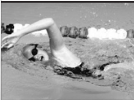
Sophomore • IM, Freestyle Anchorage, Alaska • Robert Service High School '03