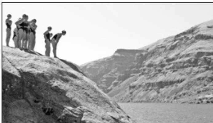
Washington State swimmers prepare to jump into the Snake River.