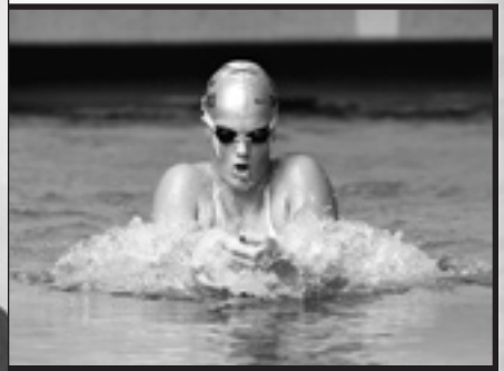
Sophomore • Breaststroke, IM, Freestyle Klaipeda, Lithuania • Gymnasium of Vertrunge '03