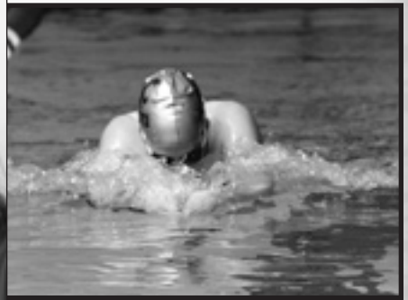
Junior • Breaststroke, IM Port Angeles, Wash. • Port Angeles High School '02