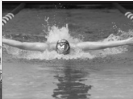
Senior • Butterfly, Sprints Calgary, Alberta, Canada • National Sport School '01