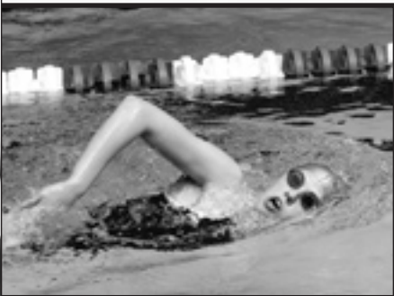
Junior • Freestyle, Backstroke Anchorage, Alaska • West Anchorage High School '02