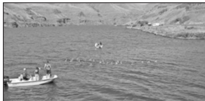
Cougar swimmers at the starting line of the Snake River Challenge.