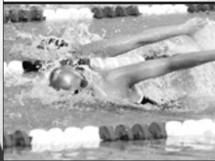
Sophomore • IM, Freestyle Loveland, Colo. • Thompson Valley High School '03