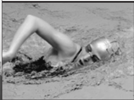
Sophomore • Sprints, Fly Healdsburg, Calif. • Healdsburg High School '03